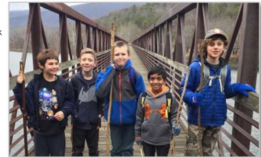
You're never too young to volunteer for Meals on Wheels! These 4th grade Cub Scouts from Pack 29, Weblo Den 6 assembled birthday boxes at a recent scout meeting and donated them for us to deliver on our meal recipients' birthdays.